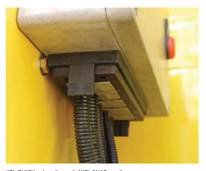
KEL-QUICK 24|10 - Page 56 / KEL-SNAP 24 - Page 31 Routing of corrugated conduits into an external enclosure of a construction machine. Tool-free mounting/unmounting with snap frame