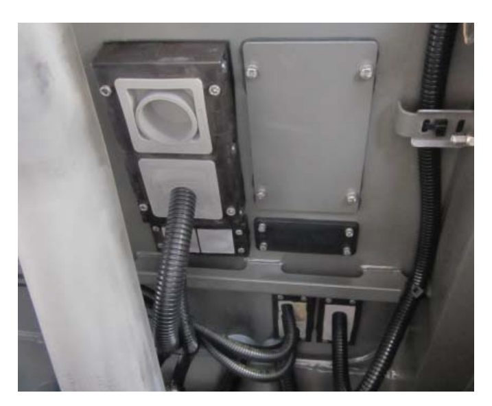
KEL-JUMBO 2 - Page 36 / KEL 24|x - Page 18 Routing of conduits and large cables between vehicle body and chassis