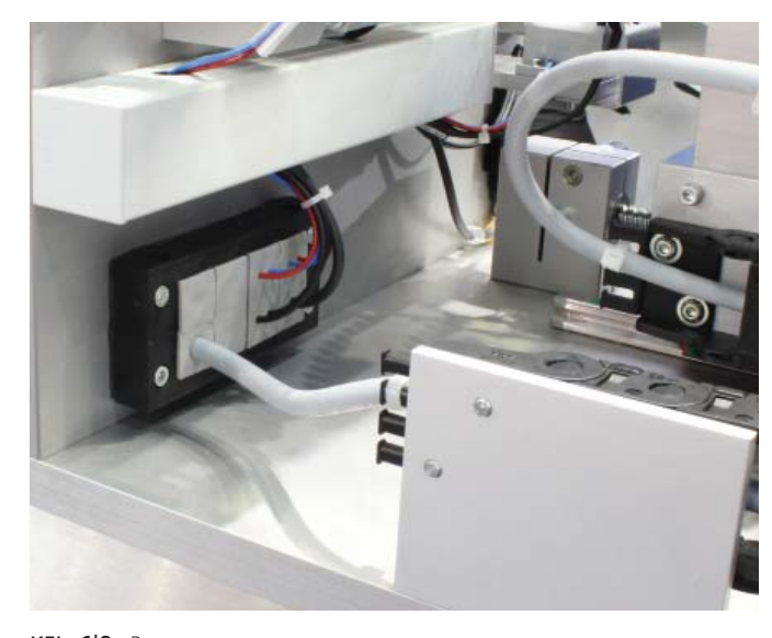
KEL 16|8 - Page 10 Routing of several pre-terminated lines into the electrical enclosure of a tension measuring machine.