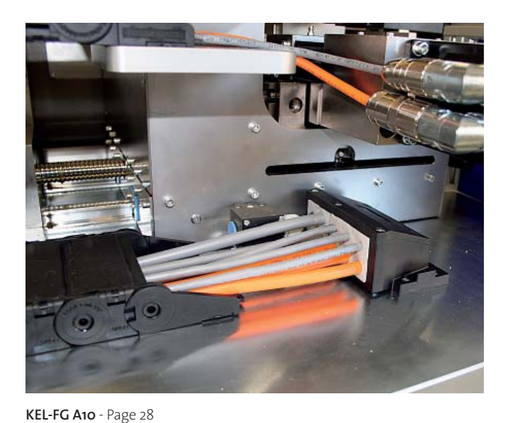
Used in combination with cable carriers to provide strain relief and compact, high density cable entry into control enclosures.